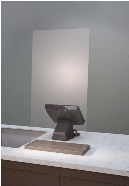
18" wide x 36" tall with woodgrain laminated base