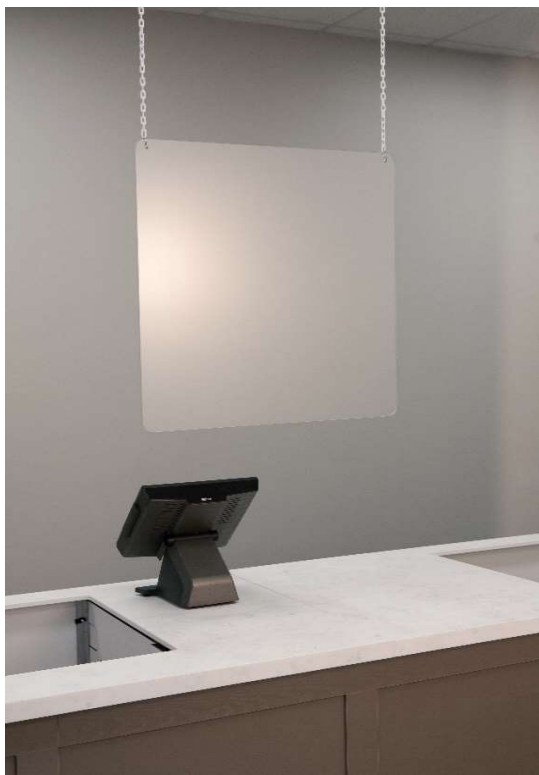
24" x 24" hanging screen with grid-ceiling mounting kit