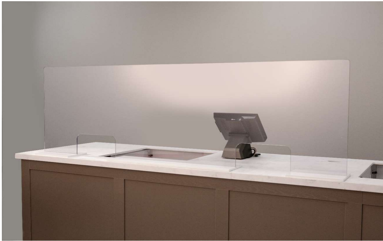
Custom multi-station unit with solid surface base - simple assembly requires no tools